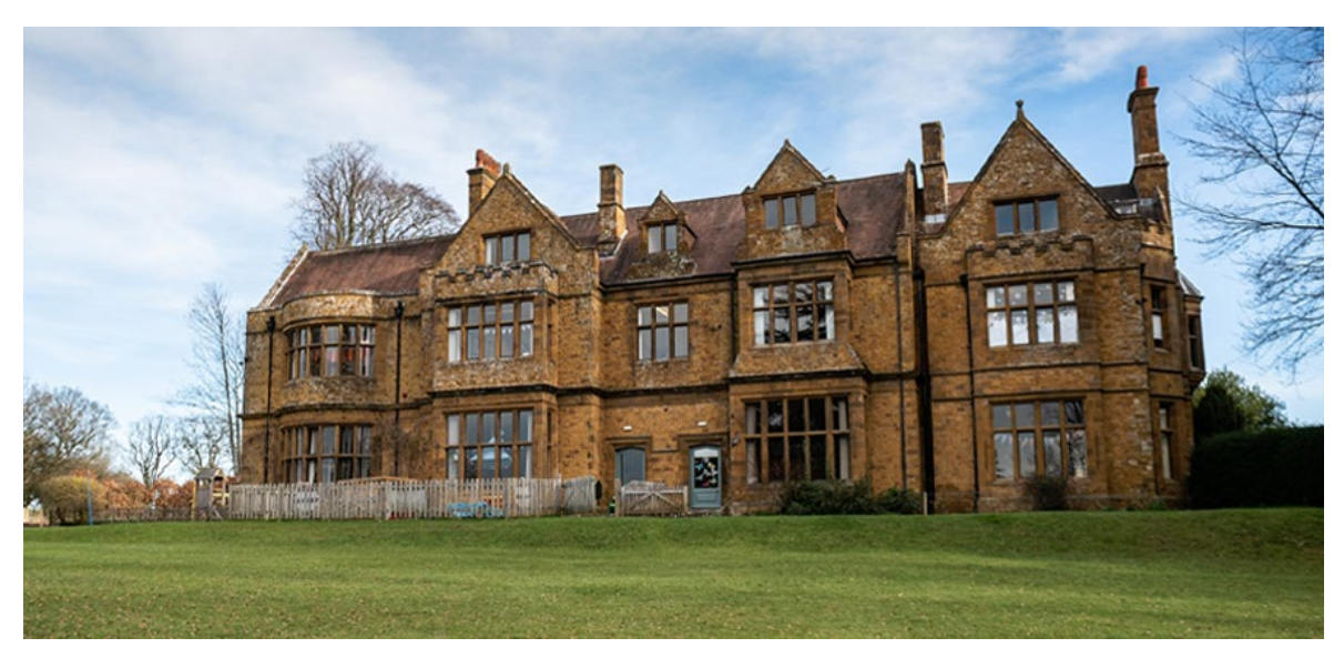
For further information about the schools, please visit www.tudorhallschool.com and www.carrdusschool.co.uk

Both schools are committed to safeguarding and promoting the welfare of children and applicants must be willing to undergo child protection screening appropriate to the post, including checks with past employers and the Disclosure & Barring Service.