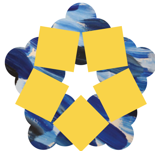
Ti3C Volunteering at Sparrow Foundation School, South Africa

We encourage the girls to sign up to activities which form part of Tudor's extensive co-curriculum with a range of sports, clubs and super-curricular provision.